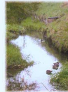
Environmental rehabilitation of Bowker Creek would enhance the trail experience