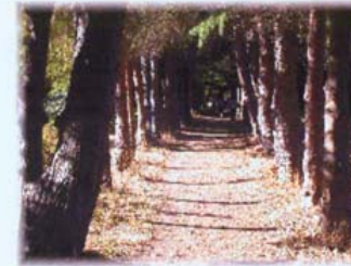
The BC Hydro lands provide an attractive greenway opportunity