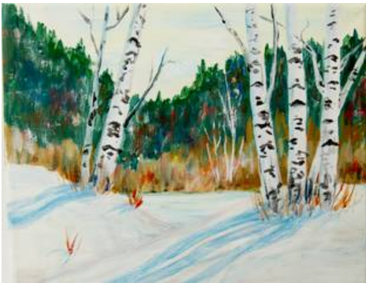
Vi's Painting of birch