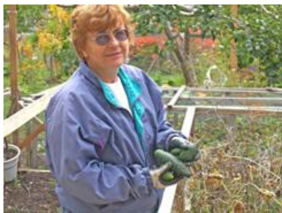
Oct. 11, 2007