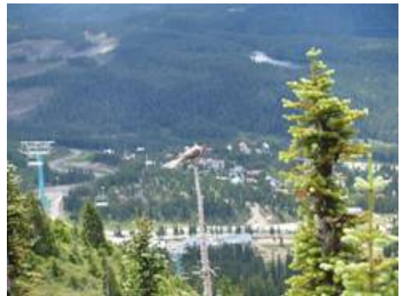
Overlooking Mountain Washington Resort from the top of the Mountain.