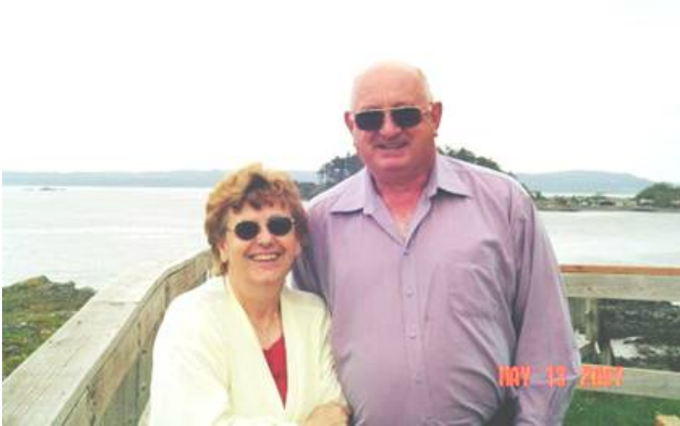
Neck Point Park

http://www.members.shaw.ca/Steviwaw/Oct%2007.htm