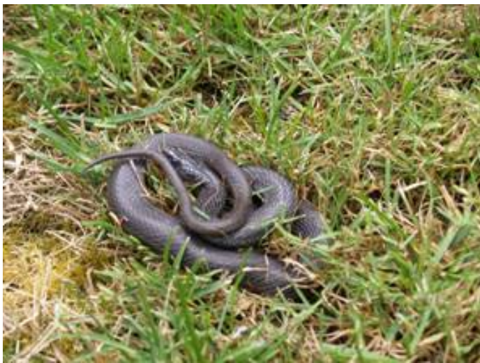
Our Cricket eater in the garden