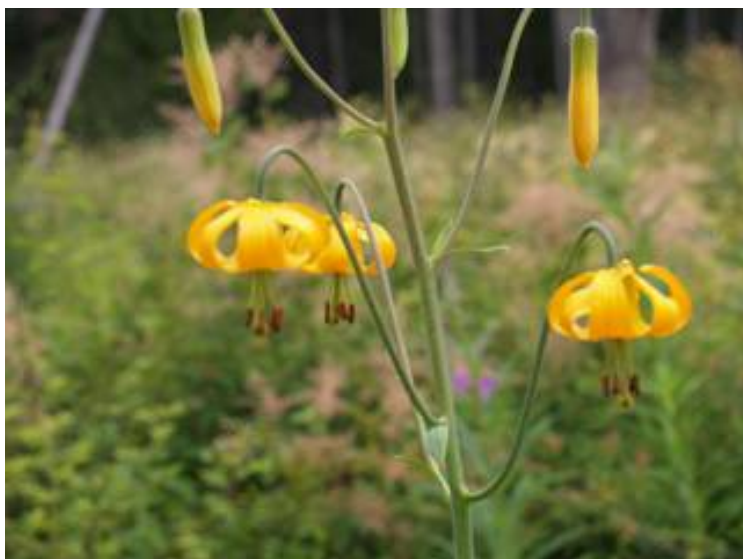
We go for walks along logging roads and find wild