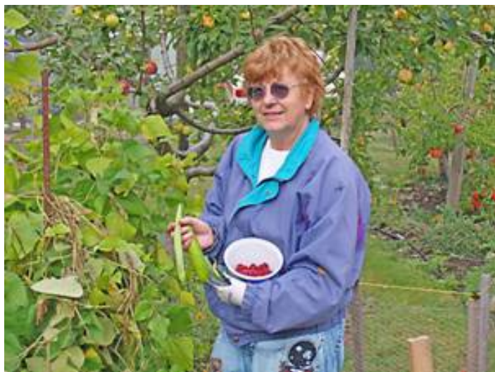
Zucchini and pole beans