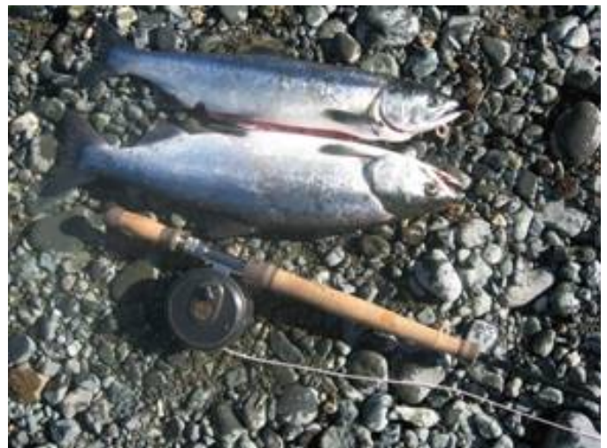
Had a good year fly fishing for Pink Salmon