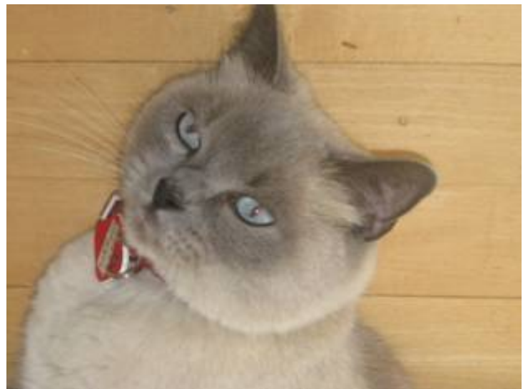
We babysat Sophie for our friends while they were building a new home.