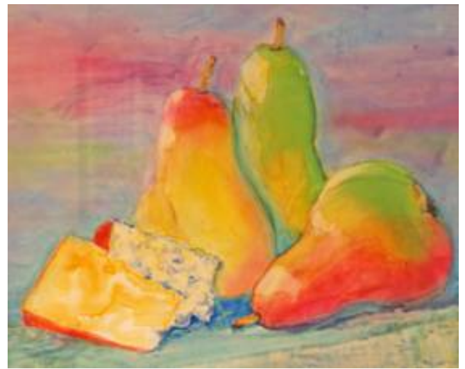
Vi's Still life on pears