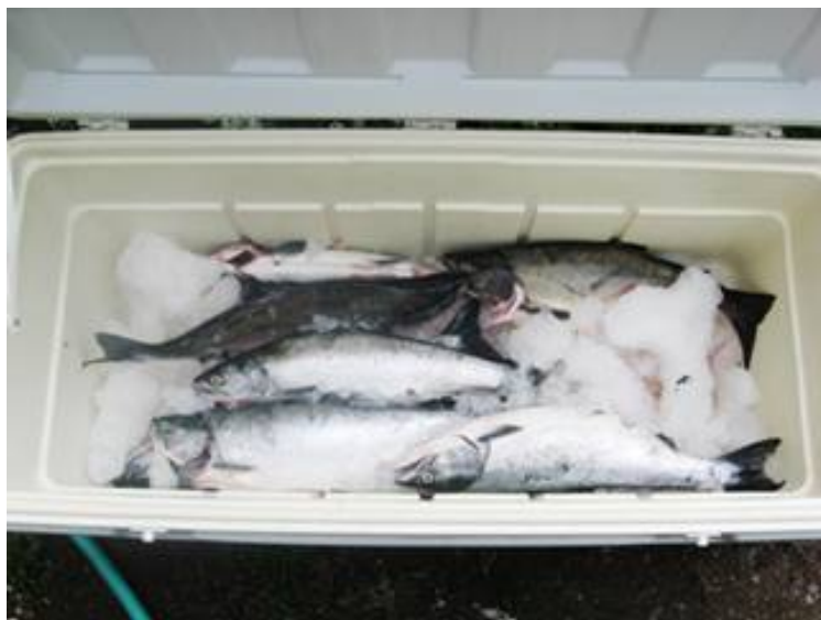
We enjoyed some candied smoked fish for Christmas with our friends.