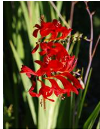
Aug. 6 th