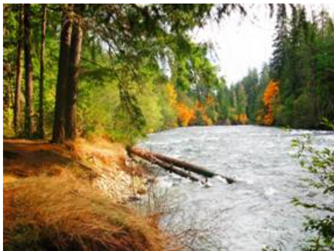
Stamp River near Port Alberni