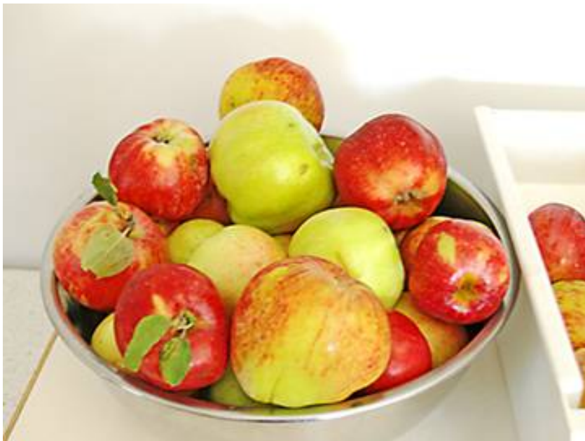
Some of our apples this year