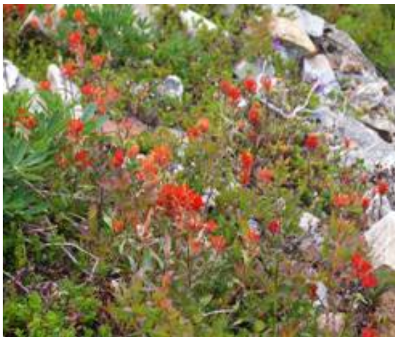
Paintbrushes on the mountain